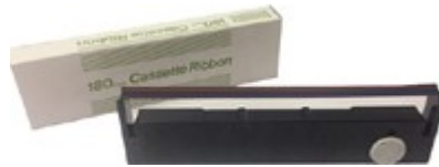
Chino Cassette Ribbon Product Code: GHT2406